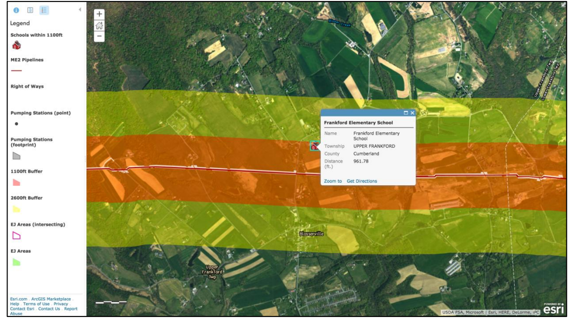
Distance from centerline: 961ft. (within estimated 1,100ft blast zone)

(a special needs charter school, formerly Frankfort Elementary) 3967 Enola Rd., Newville, PA 17241 (Cumberland County)