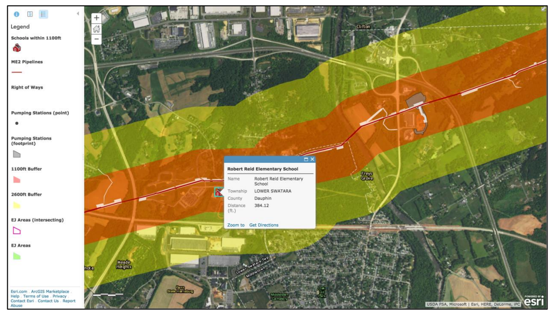
Distance from centerline: 384ft. (within estimated 1,100ft blast zone)

201 Oberlin Rd., Middletown, PA, 17057 (Dauphin County)