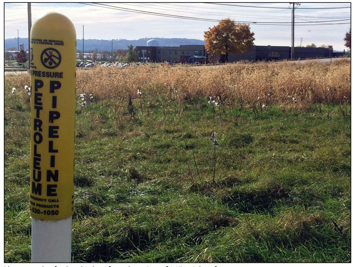
Photograph of school taken from location of ME1 right of way