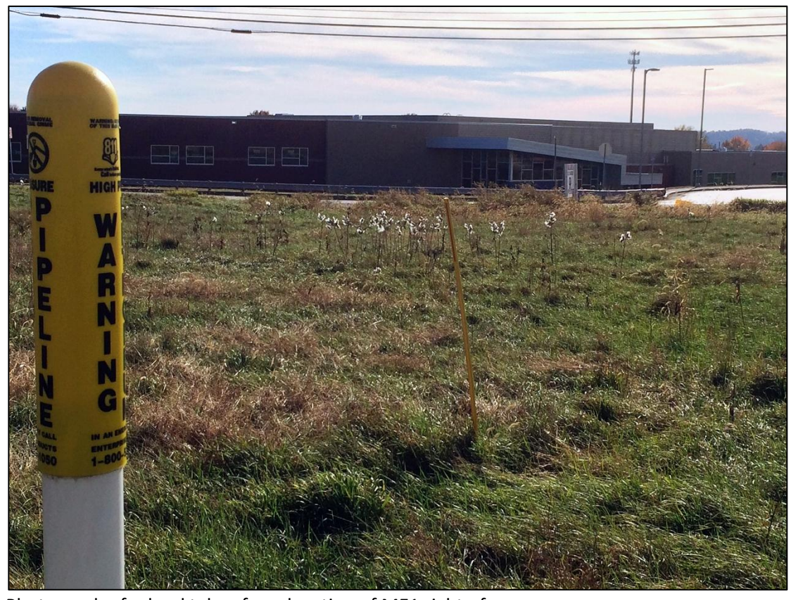
Photograph of school taken from location of ME1 right of way