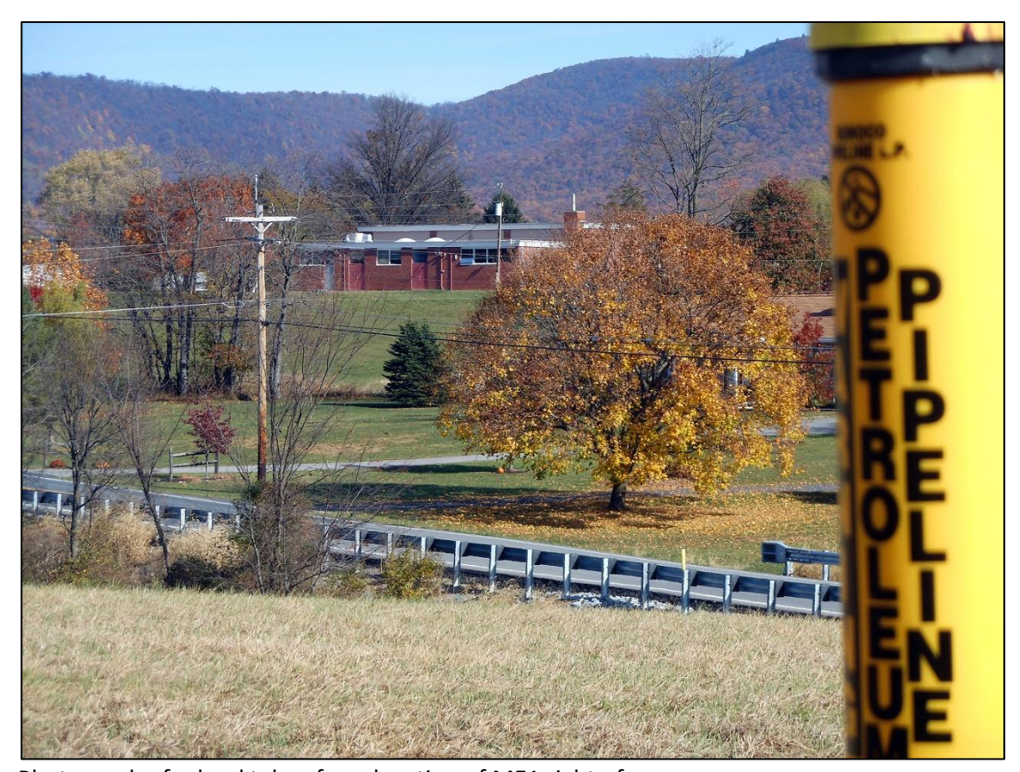
Photograph of school taken from location of ME1 right of way